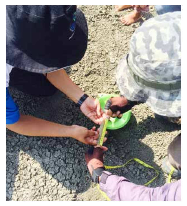
Monitoring activities by members of the Coastal Field School -Blue Forest