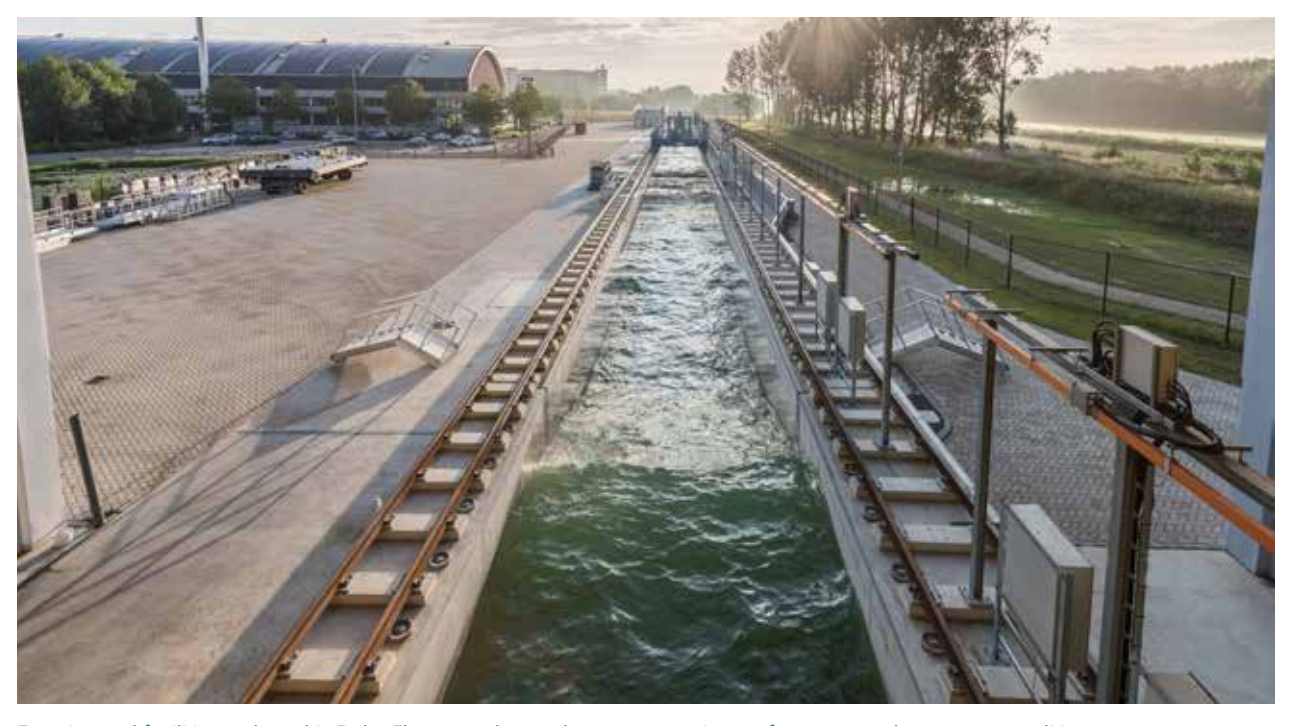
Experimental facilities such as this Delta Flume can be used to test vegetation performance under extreme conditions

to disturbances<sup>14</sup>. Further, there is ample evidence that restoration by planting of a single crop or exotic species leads to adverse effects and therefore restoration efforts better focus on reconstructing proper abiotic conditions<sup>15</sup>. However, this knowledge is not always reflected in on-the-ground flood risk reduction projects. Large-scale mangrove planting efforts, for example, are