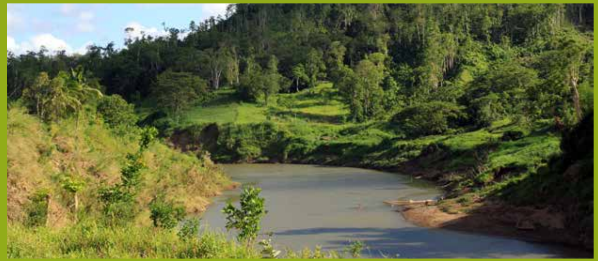
River in rural area of Fiji

Read more: Rao, Nalini S. An Economic Analysis of Ecosystem-based Adaptation and Engineering Options for Climate Change Adaptation in Lami Town, Republic of the Fiji Islands: Technical Report. 2013. http://ian.umces.edu/pdfs/ian_report_392.pdf