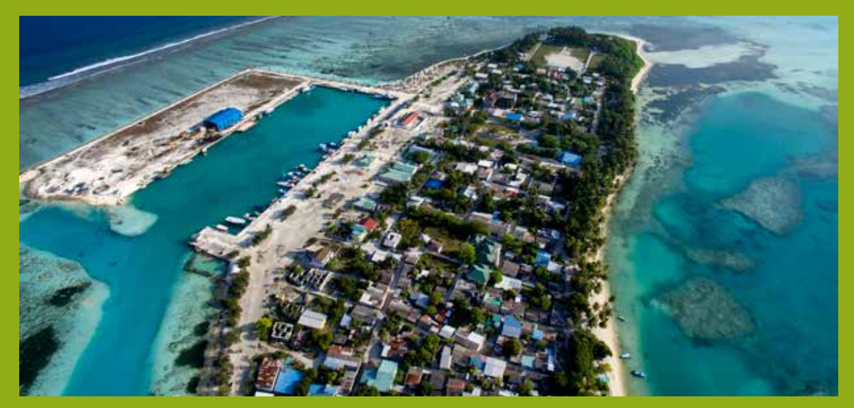
Coral reefs play an important role in protecting Small Island Developing States (SIDS) against impacts of climate change.

UNEP's project "Building Capacity for Coastal Ecosystem-based Adaptation in Small Island Developing States" is being implemented in Grenada and the Seychelles. In Grenada, social and ecological vulnerability impact assessments (VIAs) were conducted in three local sites (Lauriston Beach, Windward, and Grand Anse Bay). The VIA process focused on modelling and analyzing the impacts of climate change in terms of extreme events such as hurricanes and tropical storms. The focus was also on the impact of sea level rise on coastal communities and coastal/marine habitats, highlighting the problem of beach erosion in all three areas. Human activities such as building construction on beaches were also examined. Various coastal adaptation options were proposed based on the identified vulnerabilities. This included coral reef and mangrove restoration, locally managed marine areas, beach nourishment, breakwaters and stone revetments, among others.